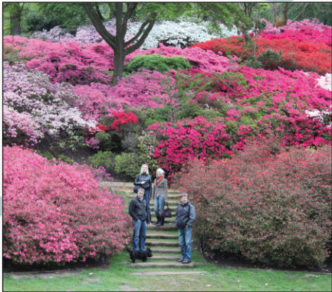
Spring azaleas in the Valley Gardens