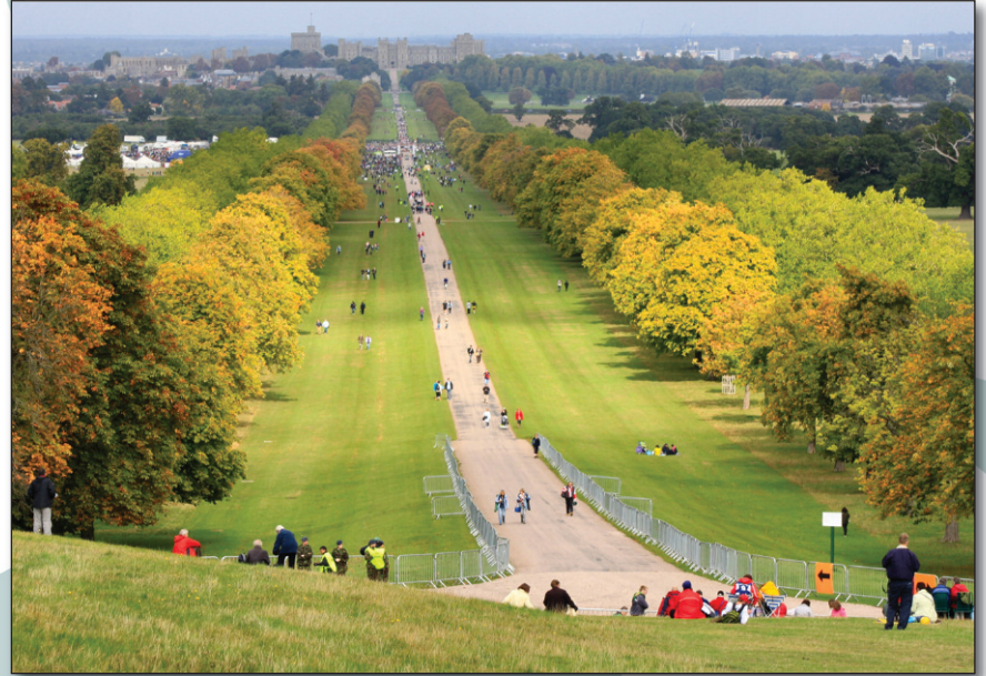
The Long Walk to Windsor Castle