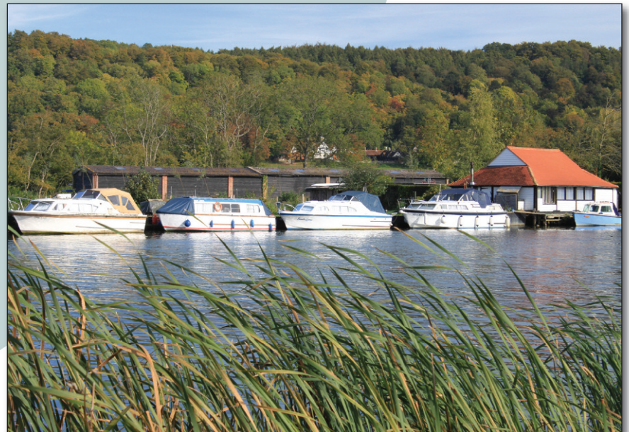
Boat house on the Buckinghamshire bank of the Thames