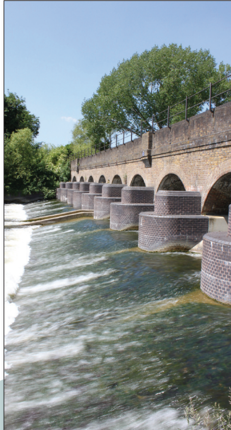
Black Potts Weir