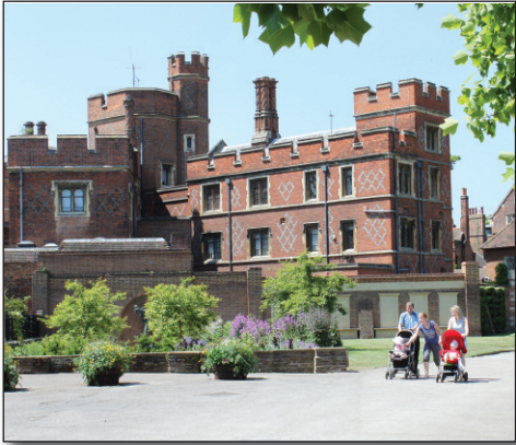
Eton College from the playing fields